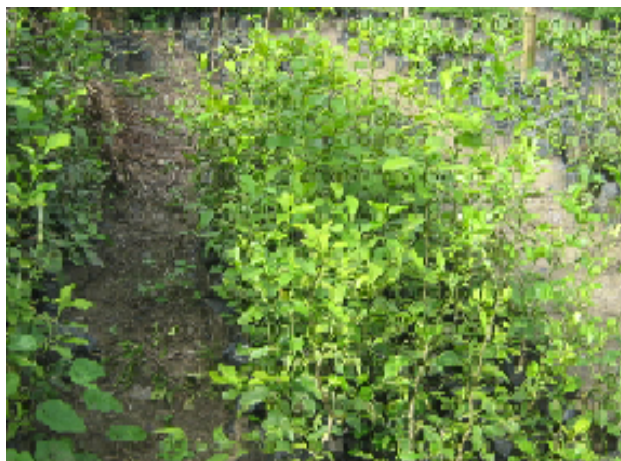
Above are pictures of nursed seedlings of different trees in the nursery