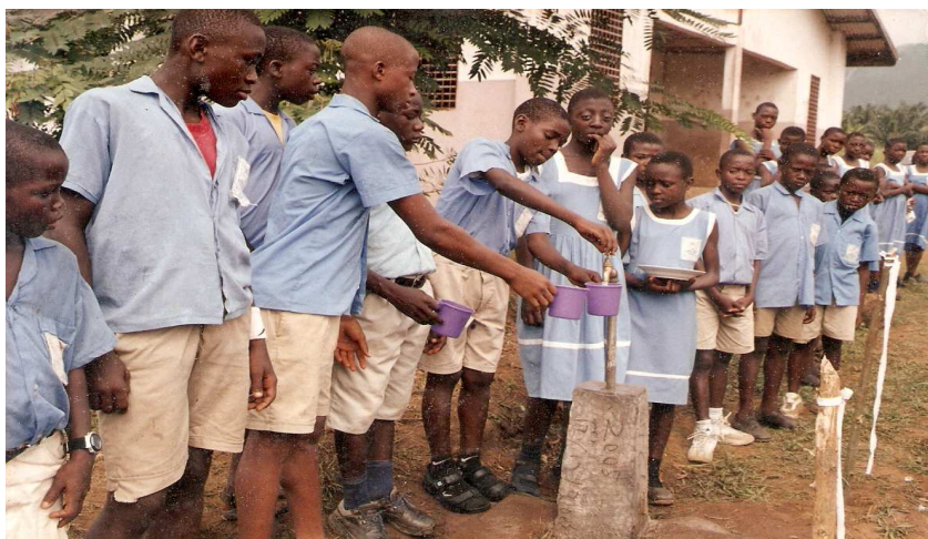
To minimize water borne diseases and boost vegetable production in schools, YDC supplied and extended pipe borne water to schools. Above is a picture of children carrying water from a tap stand provided by YDC at C.S Muyuka