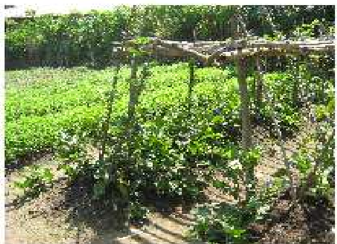
Above is a cross section of a school vegetable garden in C.S Mutengene and P.S Yoke.